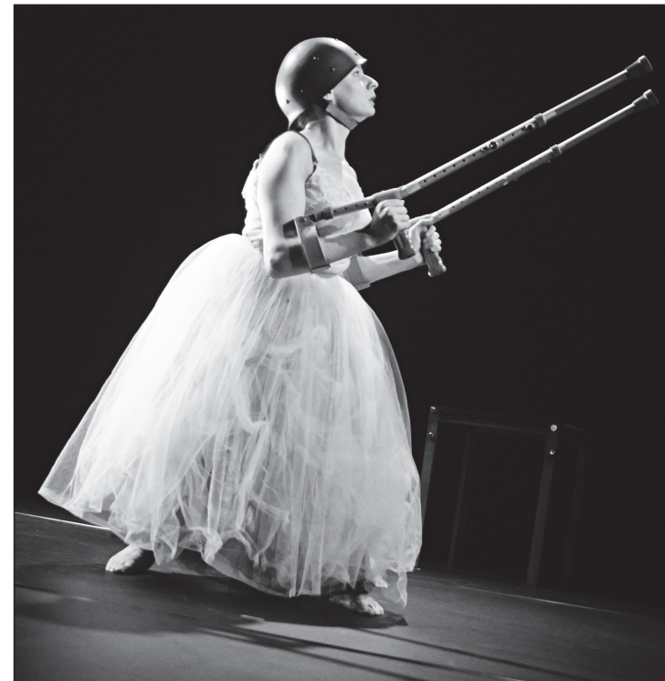
SNAP OF THE DAY: National Theatre of Scotland's 'Ménage à Trois' at Paterson's Land.

most of all, have your wits about you, to survive the White: the bewildering, blustering space of endless emptiness, beyond where no man has gone. Thankfully, Antler Theatre have all the necessary vigour and striking ingenuity in hand. A rugged, minimalist production of saucepans and handmade tools, shaggy fur coats and woollen hats, 'Where the White Stops' is a playful and fantastically physical production, that batters you, like a blizzard, with minute after minute of innovative and hearty storytelling. Both warmingly emotive and chilling with danger and a mind-bending sense of the unknown, littered with transportive sounds and headily imaginative stories, 'Where the White Stops' treads into the territory of truly exceptional theatre.