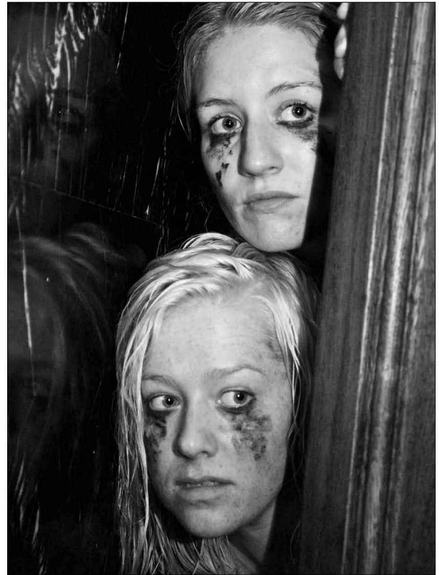
SNAP OF THE DAY: Go on, take a sneaky look, ShadyJane's show 'Sailing On', twice daily at the New Town Theatre.

Satirising those who come to the Fringe for a TV commission, 'Bad Bread' decide